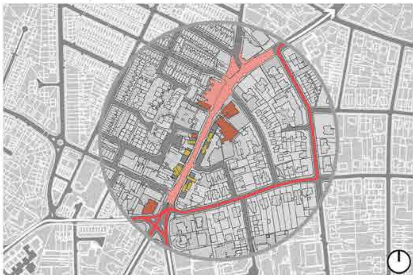
Masterplan - Site Plan Proposed High Street Diagram