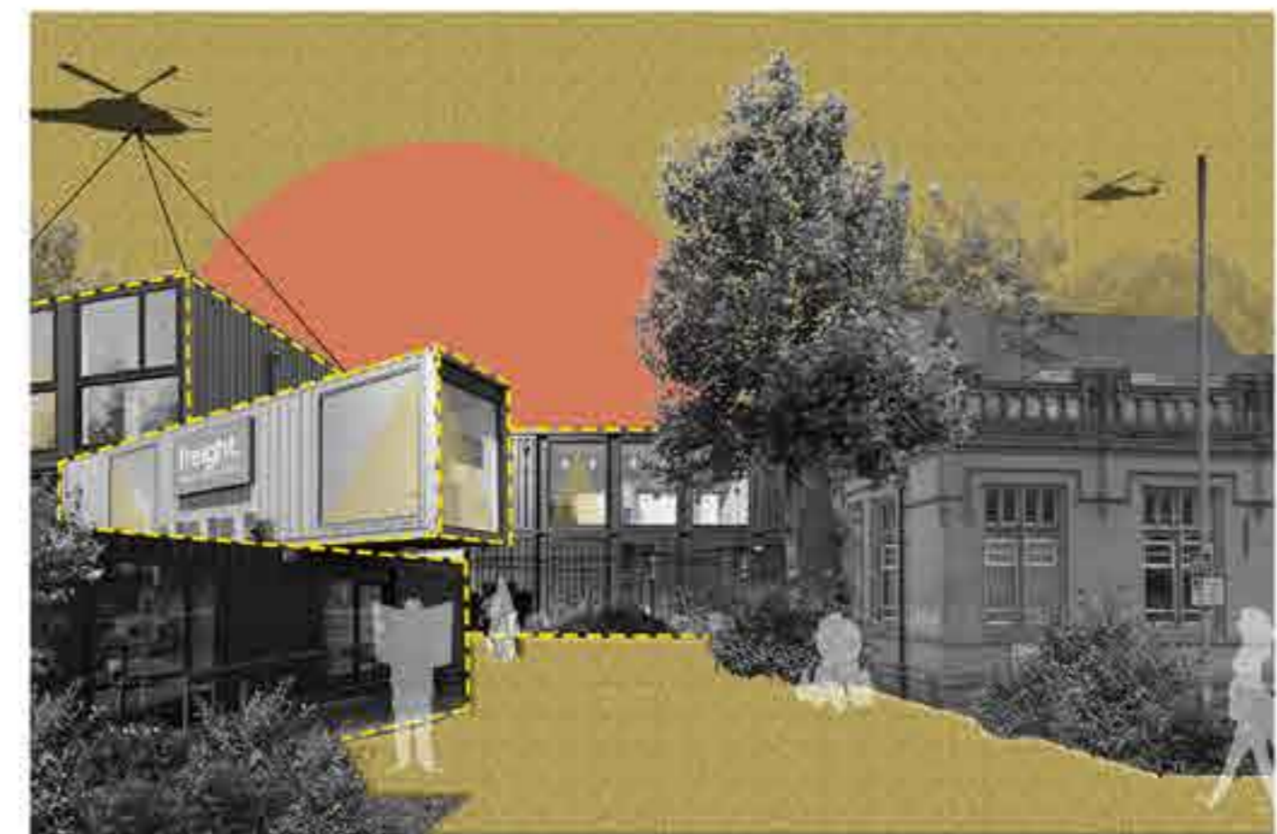
Visualisation - Whithington High Street Perspective