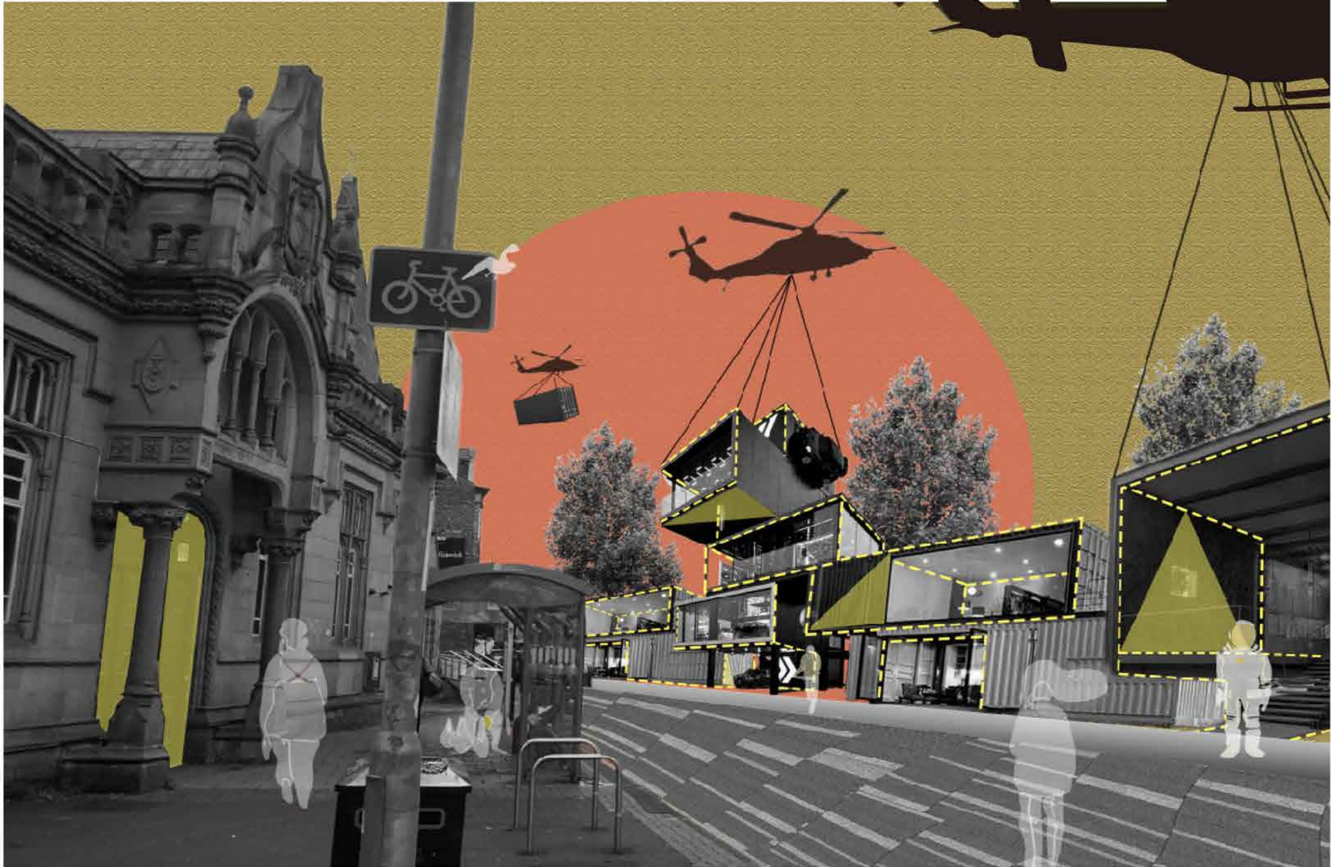
Visualisation - Whithington High Street Perspective

"improve and adapt its town centre...earlier in the process of delivering positive change" pg7 The High Street Report.