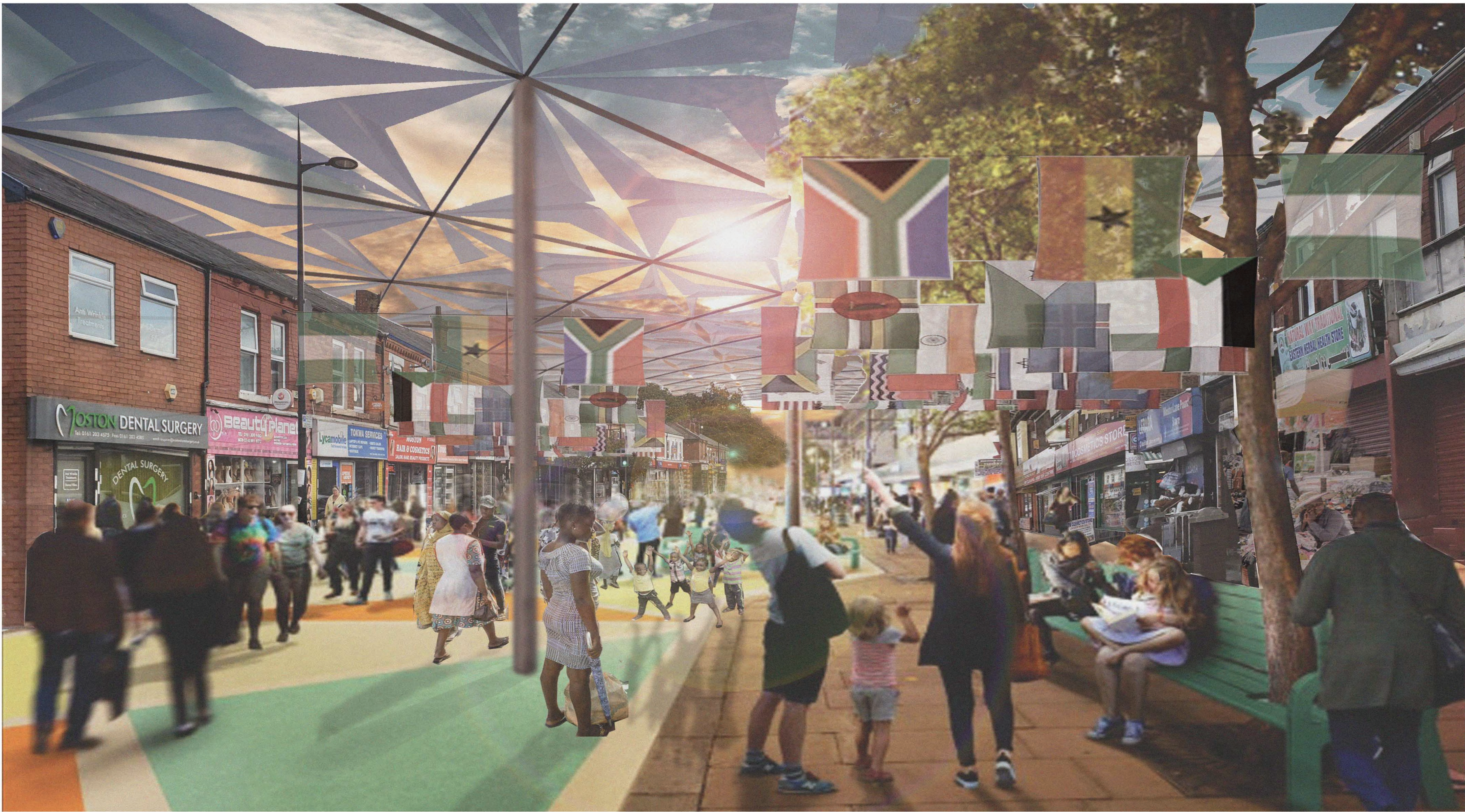
Visual - Moston Street perspective