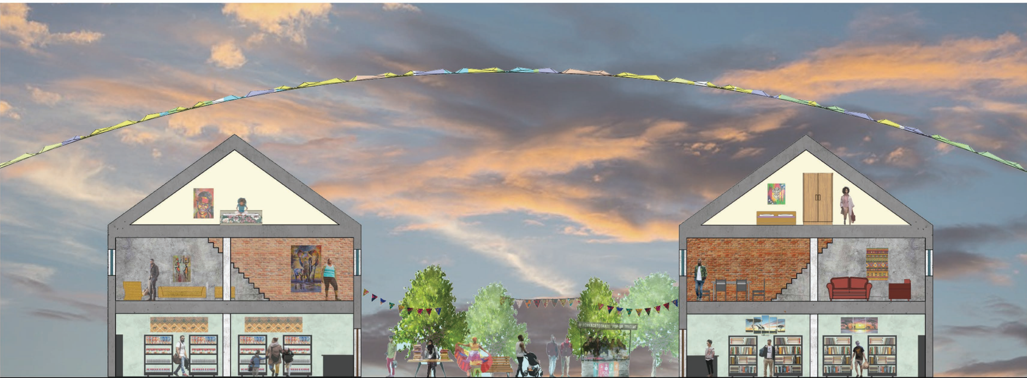
Cross section - Moston Street