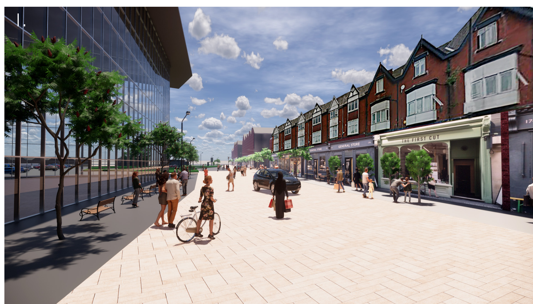
New landscaping promotes greenery and biodiversity in Gorton.