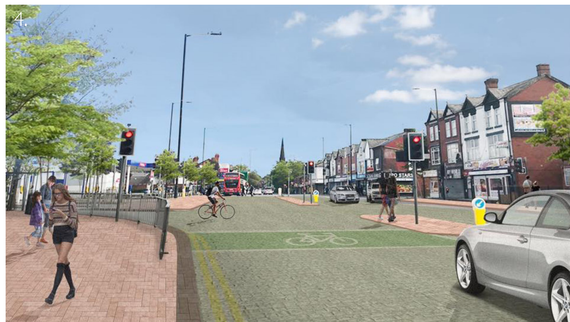
Introduction of more cycle routes to promote alternative transport.