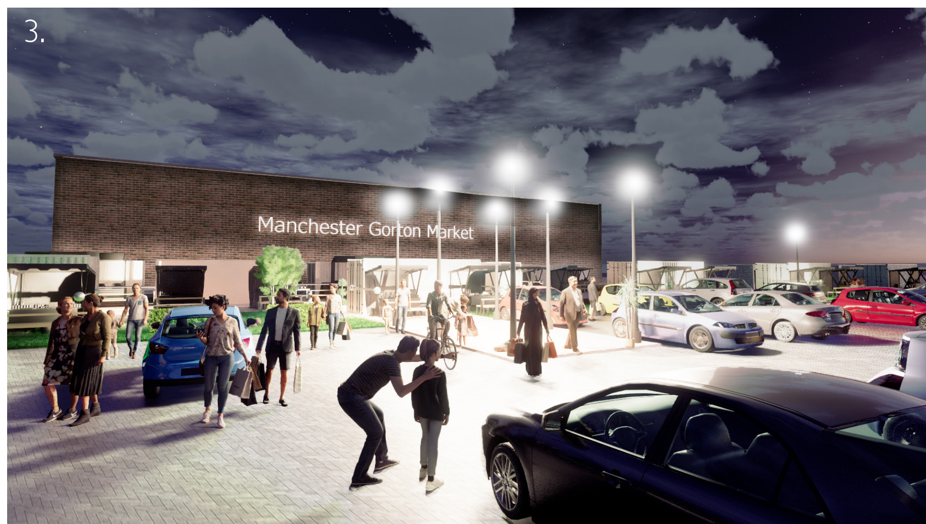
A street market located outside will attract more visitors and business