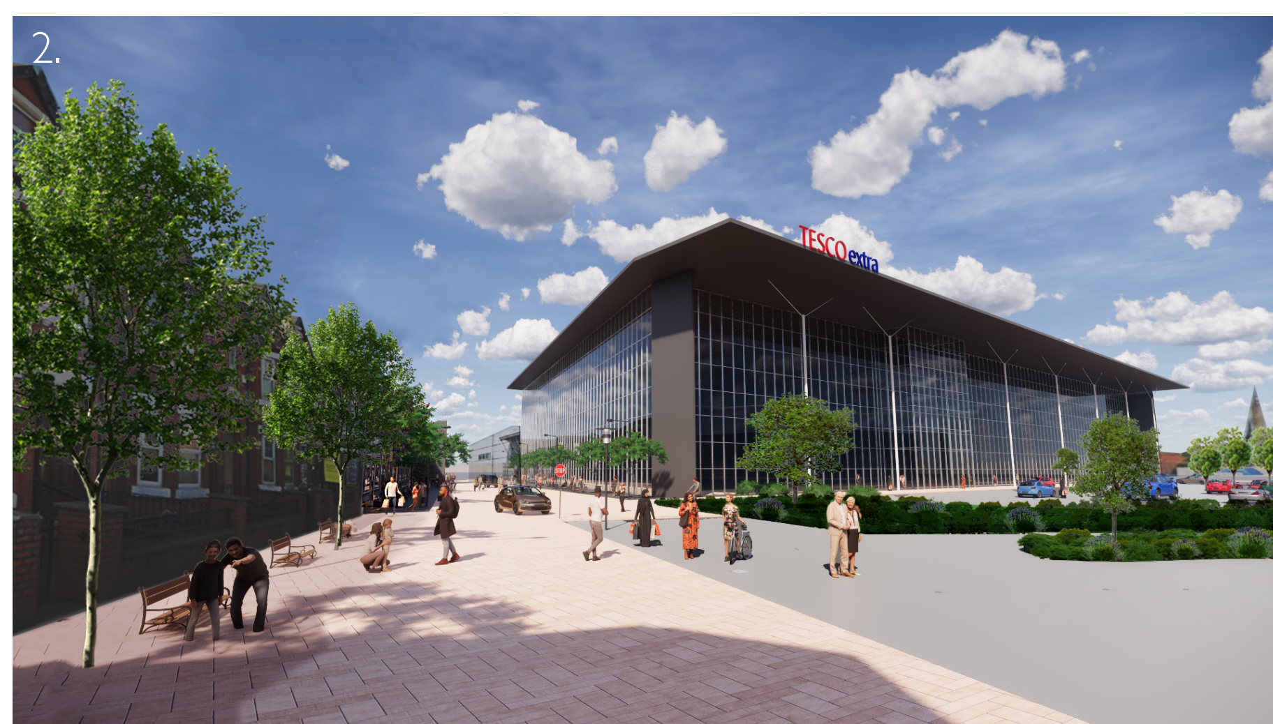
Hyde Street as a shared zone allows for multiple modes of transport.