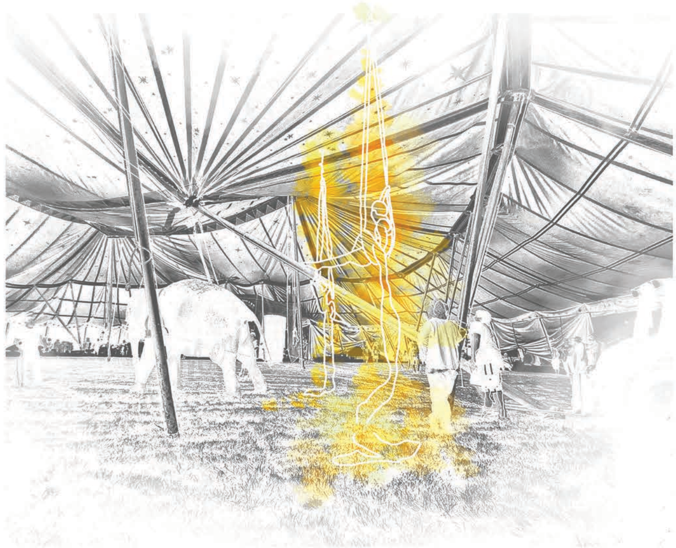
performances (level two)