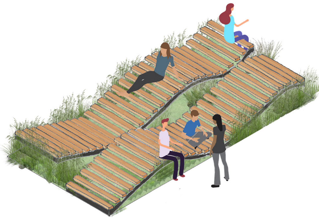
Interactive Seating Area