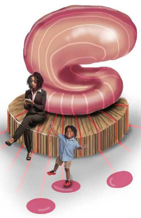
Seating Area + Art Installation