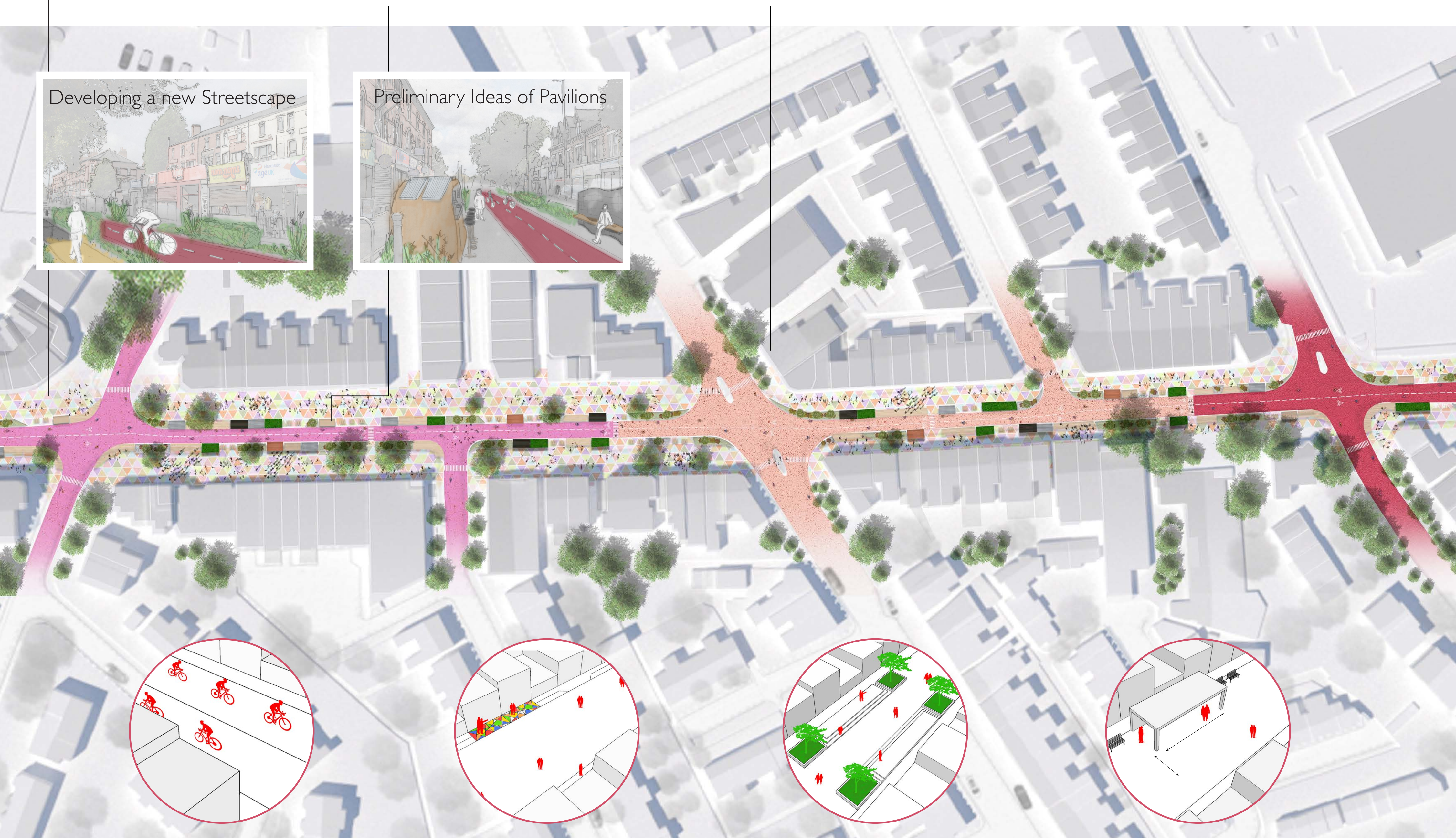
Bicycle lanes and bicycle parking areas.